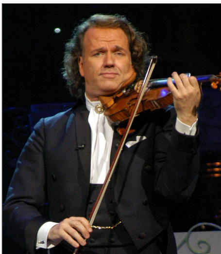
André Rieu performing in Durham

In April, NH Outlook's six-part Seeing Seniors series debuted, addressing issues that affect the state's aging population. The community outreach project, funded with a $60,000 grant from Sound Partners for Community Health, included five forums with partner Seniors Count/Easter Seals NH.