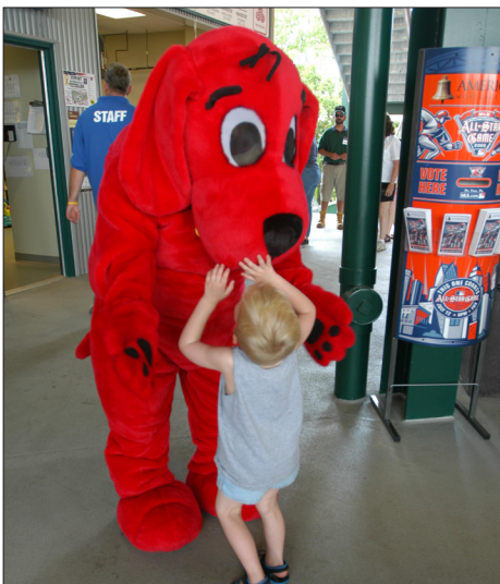
Clifford, The Big Red Dog, meets a fan at a Fisher Cats game in June