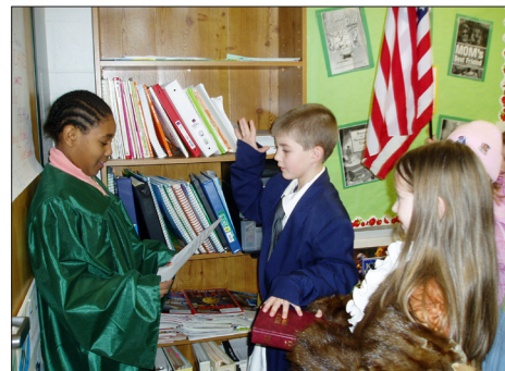
Students participate in mock government activity

In May, NHPTV, the Maine Public Broadcasting Network and WGBH presented Dutch violin virtuoso André Rieu in a sold-out concert at UNH's Whittemore Center Arena, drawing the state's largest-ever gathering of public television supporters.